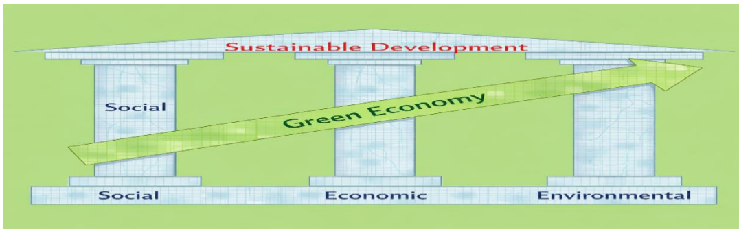
Figure 02 – Processes of Transition to Sustainable Development

The green economy can be understood, in its simplest terms, as an extension and evolution of the concept of sustainable development, which has gained prominence since the Stockholm Conference on the Human Environment, an event that also established the United Nations Environment Programme. This clearly underscores the importance of adopting a green economy due to its potential to achieve sustainable development, combat poverty on a broad scale, and promote growth and employment. The dissemination of the green economy concept also provides a new perspective on the interconnection between the economic and environmental dimensions of sustainable development, in addition to the social dimension, as it aims to reduce poverty and enhance welfare. Consequently, it opens the way for mobilizing support for sustainable development through a new conceptual framework that does not replace sustainable development but rather reinforces the integration of its three dimensions: economic, social, and environmental.