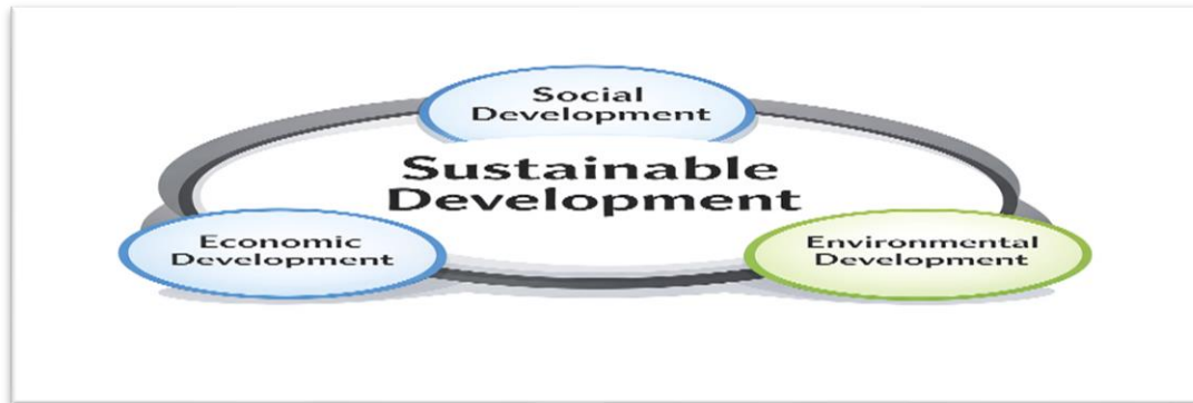
Figure 01 – Model of the Balance Among the Ecological, Economic, and Social Systems

The philosophy of sustainable development also emphasizes an important fact: that environmental care is at the core of economic development, given that natural resources form the foundation of industrial and agricultural activity. The present generations often exploit these resources, achieving success in growth or competition, while neglecting the rights of future generations to the environment and natural resources. This, undoubtedly, threatens the continuity of development in the future. True success lies in preserving the natural resource base and environmental determinants while achieving the desired economic and social growth. The following figure illustrates this concept.