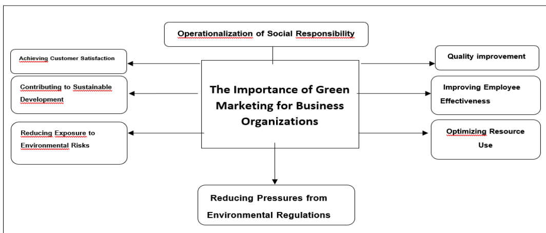
Figure N. (03): Dimensions of the Importance of Green Marketing in Business Organizations

The dimensions of the significance of green marketing in business organizations are as follows: